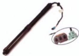
POWER LIFTGATE STRUTS