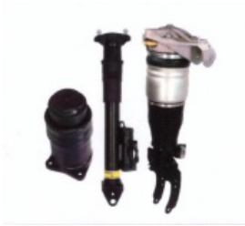
COMPLETE ELECTRONICALLY CONTROLLED AIR SUSPENSIONS