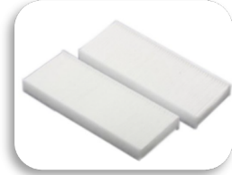
Filter, interior air

Dimension: 11.61 x 1.57 x 7.28 inches Weight: 0.22 pounds