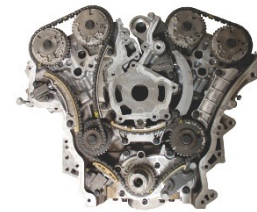
Engine Timing System & Accessory Drive Parts