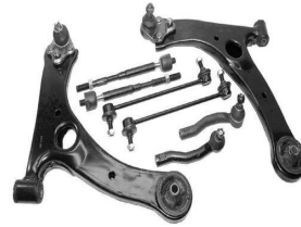
Steering & Suspension Parts