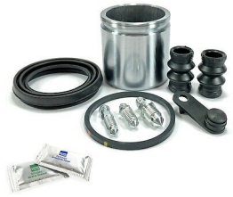
BRAKE CALIPERS REPAIR KIT