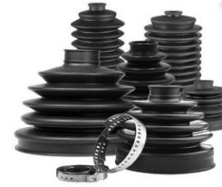
CV Joints & Boots