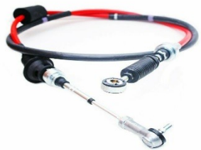
GEAR SELECTOR CABLES