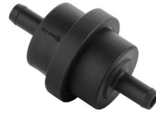
LPG/CNG PURIFICATION FILTERS