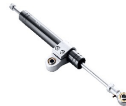
STANDARD SHOCK ABSORBERS STEERING DAMPER