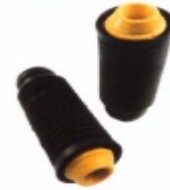
DUST COVER KIT